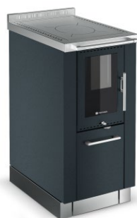
PANORAMA Anthracite F9 Reinforcement Anthracite F9 (optional)