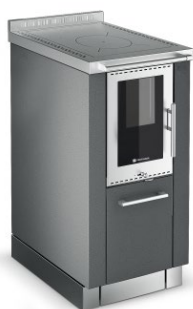
PANORAMA Black silver F1