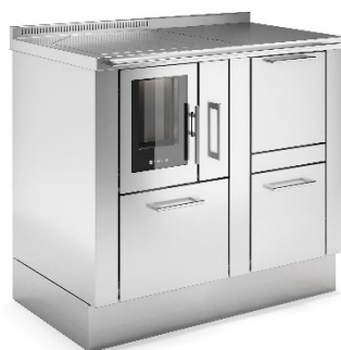
PELLET 60 PANORAMA + PELLET TANK Inox