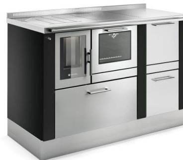
PELLET 90 PANORAMA + PELLET TANK Nero F5 / Inox