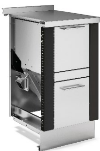
PELLET TANK Nero F5 / Inox