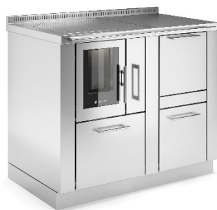
PELLET 60 PANORAMA + PELLET TANK Inox