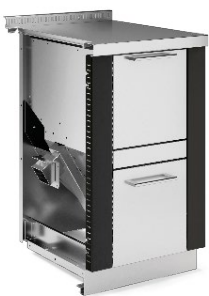
PELLET TANK Nero F5 / Inox