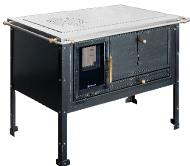
PANORAMA (optional) DEKOR Vintage