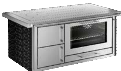
TREND Stainless steel