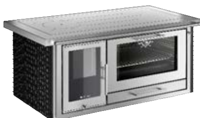
PANORAMA Stainless steel