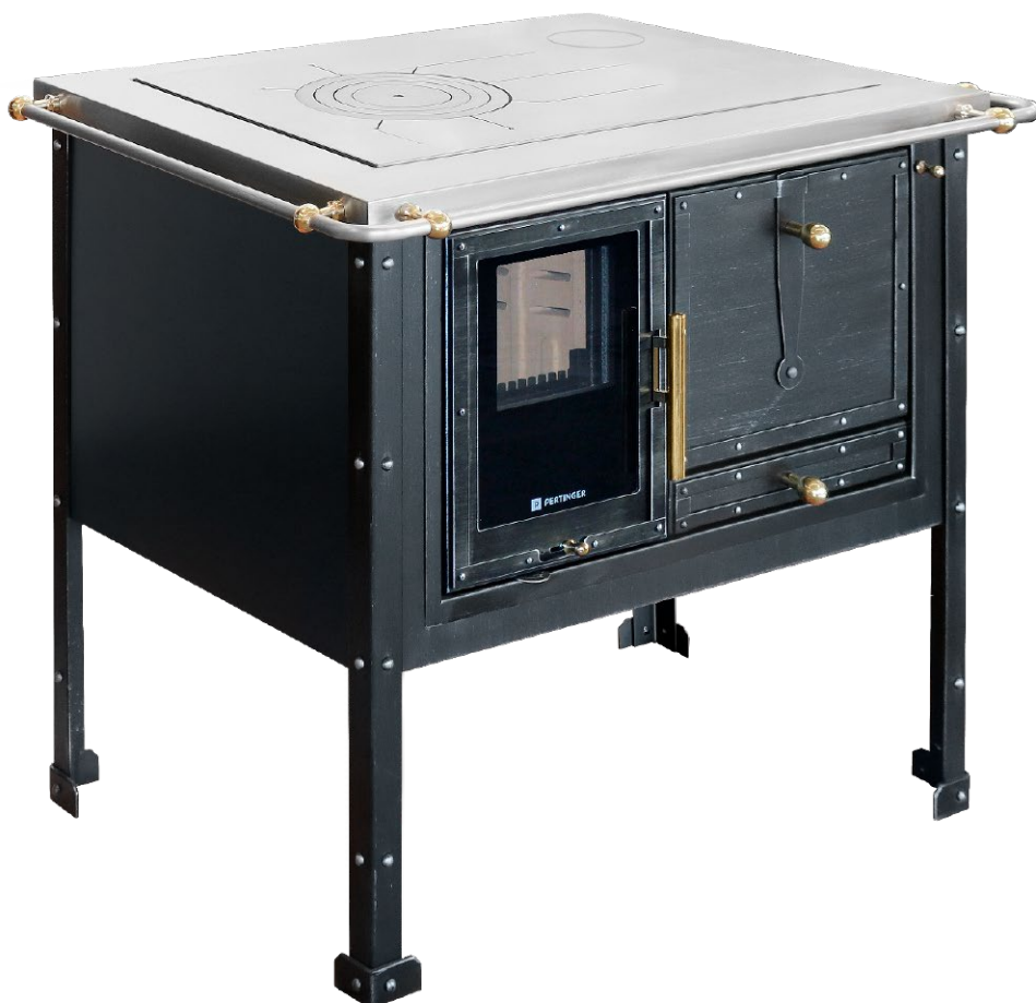
PANORAMA (optional) DEKOR Vintage