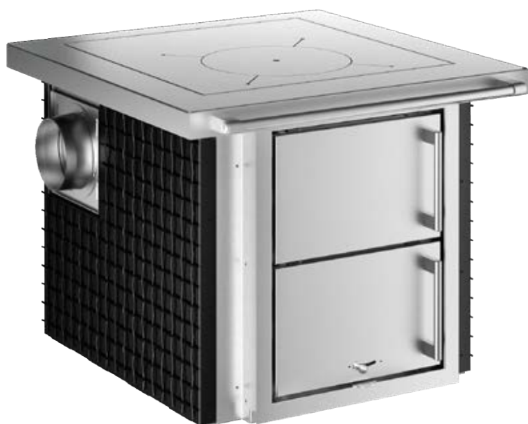
TREND Stainless steel