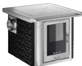
PANORAMA Stainless steel