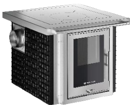
PANORAMA Stainless steel