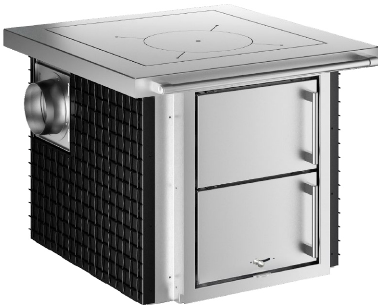
TREND Stainless steel