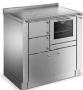
TREND Stainless steel