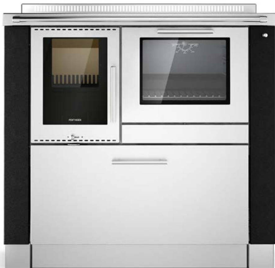
PANORAMA Black F5 / Stainless steel