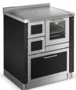
DEKOR ST21 / Black F5