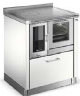
PANORAMA White F8