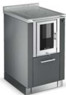
PANORAMA Black silver F1